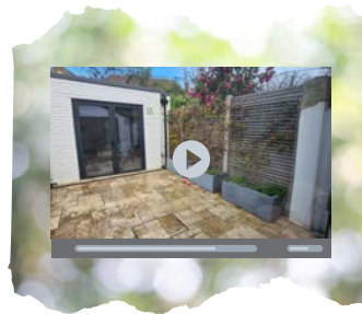
Virtual Site Survey